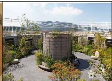
National Museum of Modern and Contemporary Art, Korea (Gwacheon)