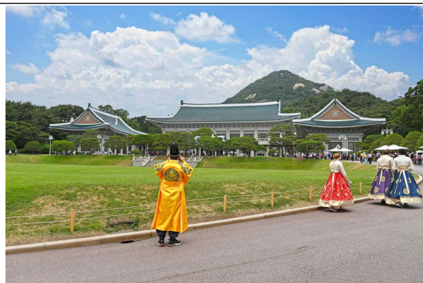
Cheong Wa Dae

Discover Korea's history at Cheong Wa Dae, the previous presidential residence closed off to the public, and Gyeongbokgung Palace, a royal residence of the Joseon Dynasty located at the heart of the city. After a history tour, experience Korea's modern lifestyle! Cool off at a fun summer festival with all things wet, from water slides to fountains!