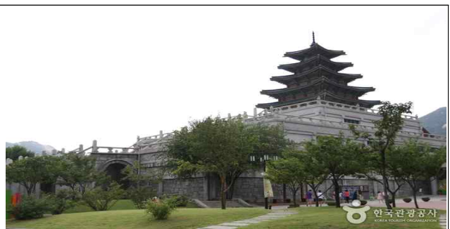
National Folk Museum of Korea