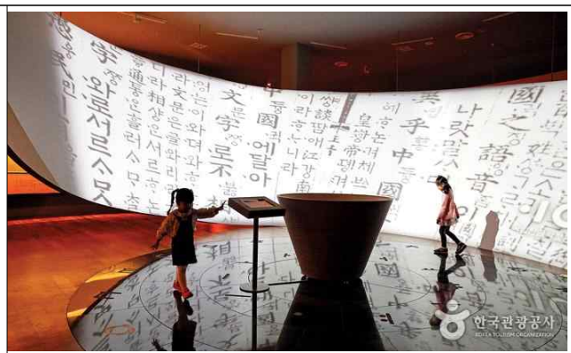
National Hangeul Museum