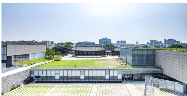
National Museum of Modern and Contemporary Art, Korea (Seoul)

For the last stop, enjoy the shaded paths through the secret garden of UNESCO-recognized Changdeokgung Palace.