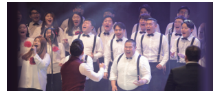
Heritage Mass Choir